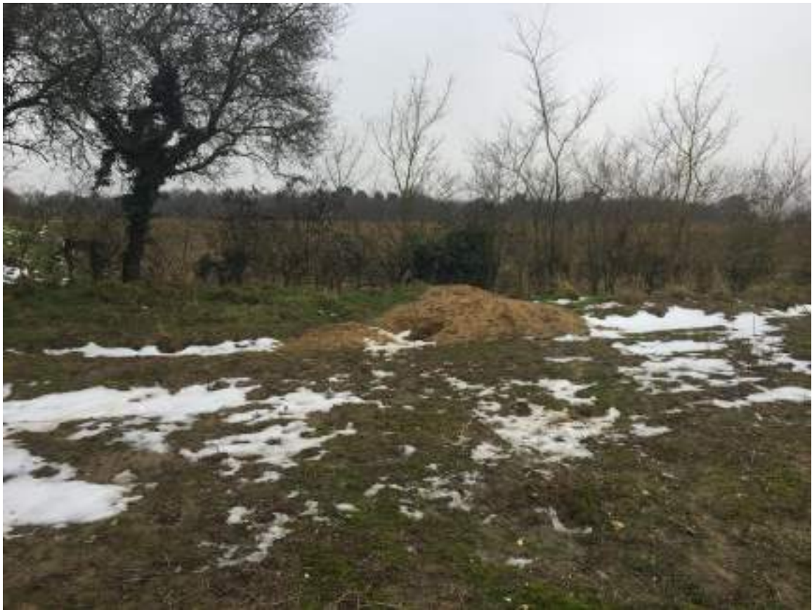
Sett 2 along boundary with Footpath 7.