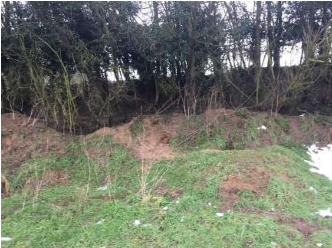
Sett 2 Hedge boundary with Grove Road