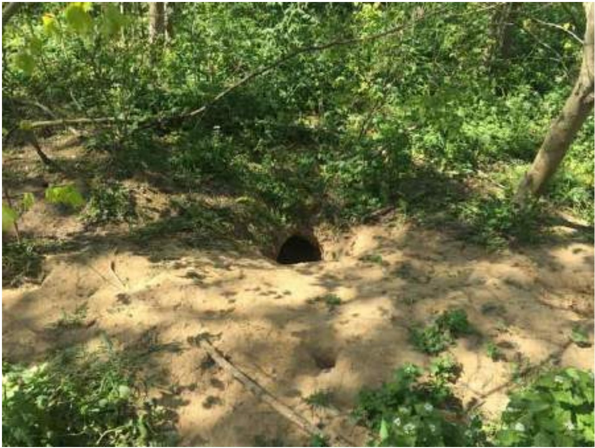
Sett 1 above. Sett 2 below.